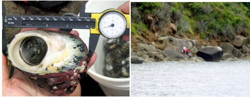
Fig. 1. (left) A large C. pica being measured and (right) two local harvesters collecting C. pica in Brewer's Bay, Tortola